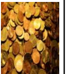
Plate €945.00 Shrines €640.00 Development Fund €1035.00

We thank all those who contribute, collect and count our finances.