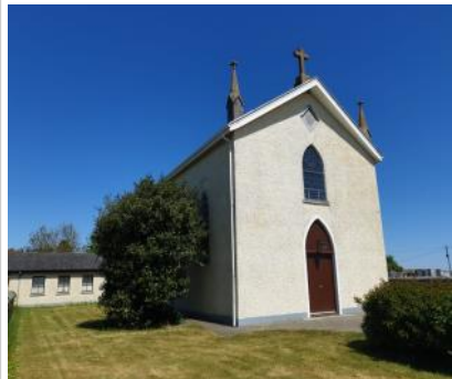
St Patrick's Church, Donaghmore.

Eighteenth Sunday Ordinary Time 31st July 2022