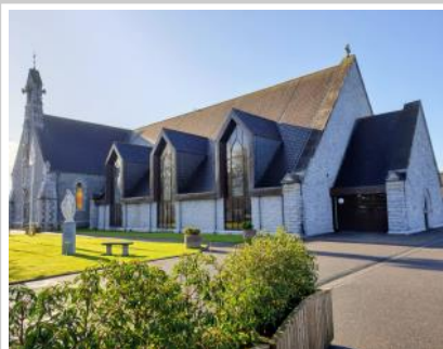
The Immaculate Conception, Ashbourne.

Email: ashbournedonaghmoreparish@gmail.com