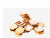
Plate €1390.00 Shrines €955.00 Development Fund €840.00 Holy Day Collection 15th August €295.00

Gratitude is expressed to all those who support our parish.