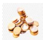
Plate €1520.00 Shrines €1160.00 Development Fund €900.00 Holy Day collection €570.00

Gratitude is expressed to all those who support our parish.