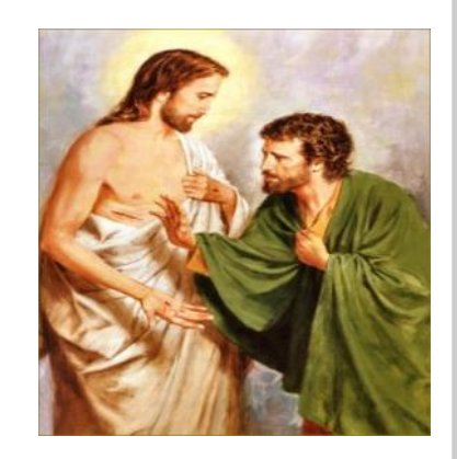
To Believe or Not to Believe