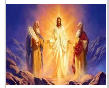
From the cloud came a voice which said

'This is my Son, the Beloved ... Listen to him.' (Matthew 17:6)